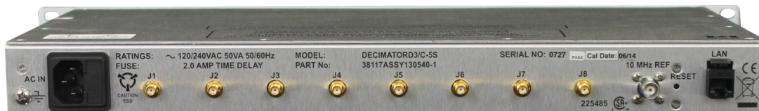
Spectrum VUE-8 Back Panel